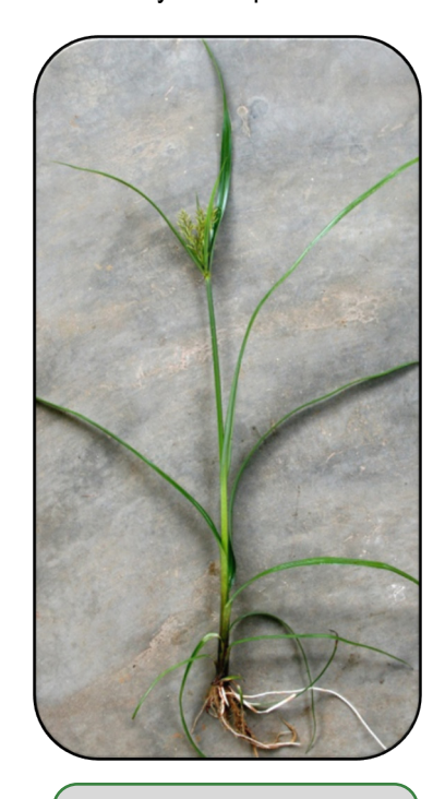
Yellow nutsedge is recognized as a major host