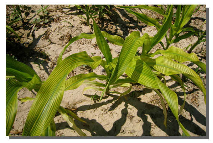
Iron or zinc deficiency symptoms in corn. Soil and tissue testing can help determine which of these nutrients is deficient.

(assumes plants started with some supply of the nutrient but ran out as plants developed.) For molybdenum, deficiency symptoms appear first on oldest plant tissues. Symptoms vary according to crop, but generalized symptoms are shown in Table 4.