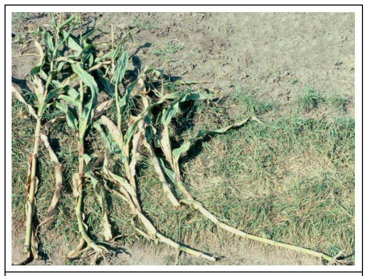
Figure 3. Left to right, control (no lodging) and plants with simulated wind lodging at V10, V12, and V16 stages. Lodging occurred in July, photos were taken in early September.