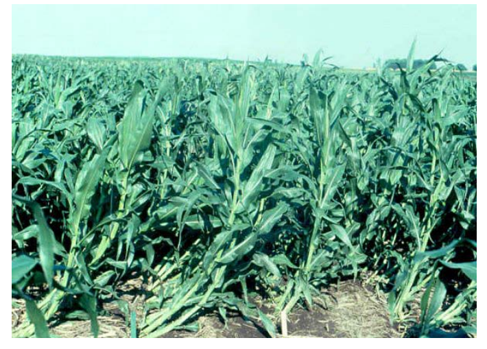
"Goose-necked" corn plants following an early July storm.

Wind lodging usually occurs when soils are saturated by heavy rain and the rain occurs with high winds. These conditions soften the soil while simultaneously applying lateral forces on the plant. Wind lodging is not always related to root injury.