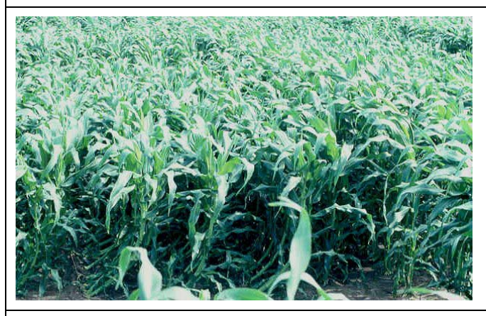
Figure 2. Same plot as above three days after simulated wind lodging.