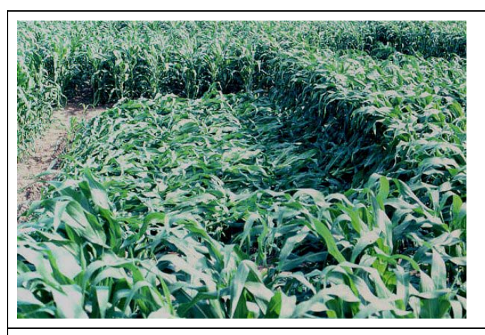
Figure 1. Research plot immediately after artificially induced "wind lodging" at the V12 growth stage.

Also, losses with combine harvest could be greater than the hand-harvested yields shown in Table 1. Following lodging, plants straightened to the extent that ears were at least 18 in. above the soil surface at harvest (Table 1 and Figures 3 and 4).