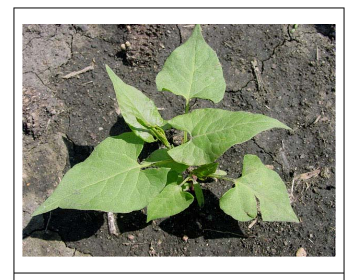
Some weed species, such as morningglory, naturally have a higher tolerance to glyphosate. Tolerant species can increase in prevalence under continuous glyphosate use.

Resistance and reduced sensitivity of weeds to glyphosate can be a problem in glyphosate-resistant crops; however resistance cases are still relatively rare. A more likely problem that growers may encounter with continuous glyphosate use is a shift in the weed community toward species that are naturally able to survive or avoid exposure to glyphosate. Despite glyphosate's broad spectrum of weed control, there are some species that are naturally less susceptible to it. Morningglory species have increased in prevalence in some areas due to their natural tolerance to glyphosate. Common lambsquarters, giant ragweed, and velvetleaf also tend to vary in their tolerance to glyphosate.