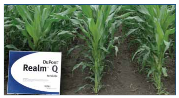
DuPont™ Prequel® 1.67 oz/A followed by Realm® Q 4.0 oz/A + COC + AMS. lowa State University, Ames, Iowa. Photo taken June 21, 2010.